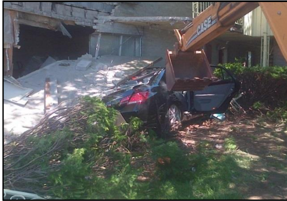
Extraction of vehicle from building

We roll out our fire equipment the most for accidents, either vehicle or otherwise. Accidents tend to be the most difficult and challenging incidents we face.