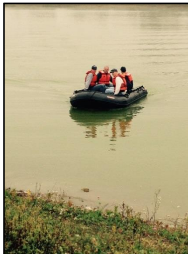
Rescue Boat Training

Regular training exercises and equipment maintenance programs are integral to ensuring department excellence. We look forward to continuing to stand at the ready in 2015, available to respond when the citizens of the City of Wilmington need us.