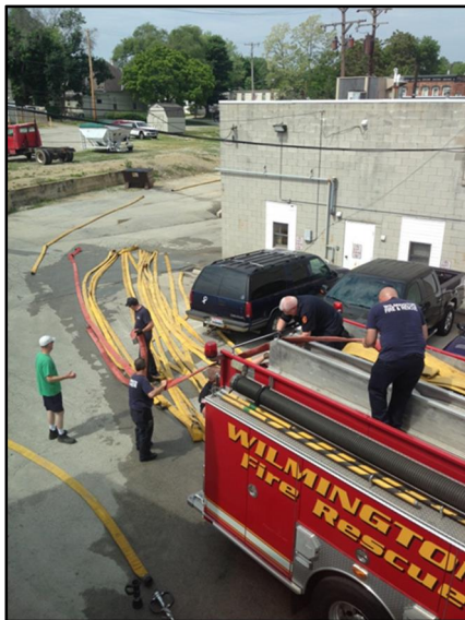
Hose pressure testing –Annual maintenance

In 2014, we started the roof project on Fire Station I and are looking forward to its completion early in 2015. Our plans to repair the in-house vehicle exhaust system are currently on hold due to budget considerations.