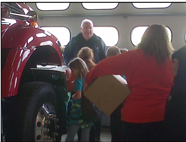
Fire Station Tour

The Fire Department and its members took part in many community events this year, including departmental tours, public interaction opportunities, as well as providing Fire and EMS coverage at special events in our area.