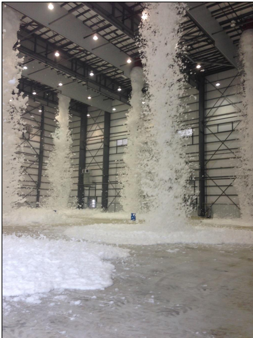
Testing of fire suppression system at JUMP hangar

Participating in the foam tests at the Air Park was particular enlightening. The picture (below) depicts testing of the fire suppression system in the new JUMP hangar. During testing, this suppression system created approximately a ten-foot layer of foam in less than three minutes.